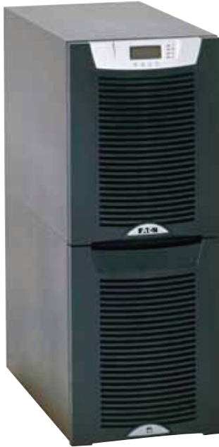
9155 8-15 kVA

Reliability and efficiency have never looked so attractive. The 9155 single-phase Uninterruptible Power System (UPS) delivers a combination of advanced technology, user-friendly design and low price that's absolutely unmatched by competing products. This innovative design offers high efficiency (90 percent or better across all load ranges), low input current distortion (less than 5 percent total harmonic distortion, with an active IGBT rectifier that delivers 0.99 power factor correction) and high power factor output (0.9 PF).