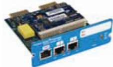
Power Xpert Gateway Card 2000